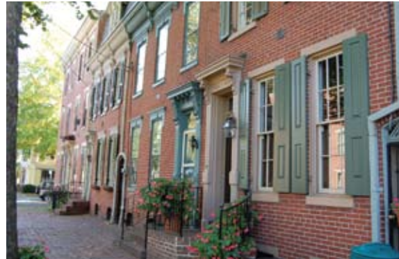
A charming row of houses in Midtown Harrisburg.

1. Put down the newspaper and see for yourself—walk along Front Street, grab a bite to eat at Nonna's and catch a flick at the Midtown Cinema with a few of your future neighbors.