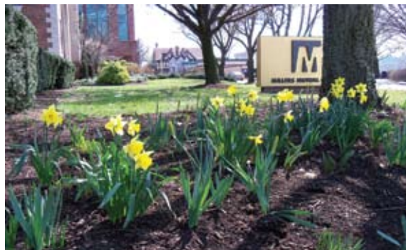
Sign of spring: A well-tended daffodil bed at Front and Forster streets, which came into bloom last month.

Start by removing all debris: sticks, dead branches and leaves. These are Mr. Winter's idea of polar décor, but they have no room in a spring garden full of color and life.