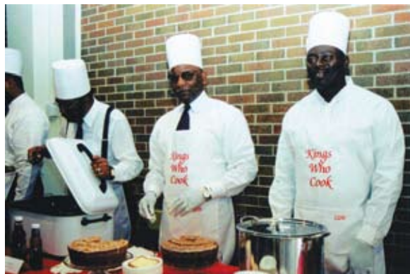
All hail the kings: A few of last year's royal chefs.

On Sunday, April 18, about 80 men will converge upon the Evangelene Kimber Gymnasium at Harrisburg High School to demonstrate their culinary talents to a hungry crowd for the 12th annual "Kings Who Cook" event.