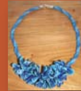
Beaded jewelry from Roxanne Tozer