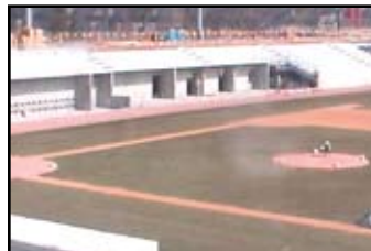
T'is the season, p. 25