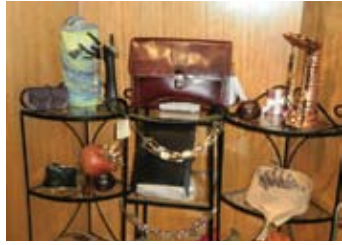
Haute culture Harrisburg, p. 6