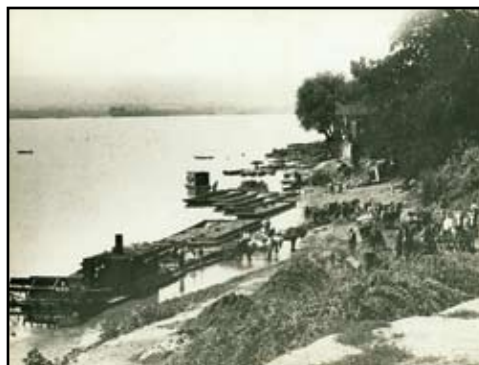
The riverfront at Hardscrabble circa 1900 (left), when it was littered with docks, pilings and shabby houses. The same area today (right), recast as Sunken Gardens. Except for a historical marker, the beautiful, peaceful park setting gives little indication of the area's turbulent past.

The plan, developed by the Harrisburg League of Municipal Improvements, was to complete the expansion of Riverfront Park, the creation of the river steps as a flood control measure, the demolition of Hardscrabble and the development of the Sunken Gardens. It wasn't until the spring of 1924 that the Hardscrabblers were finally gone, their homes