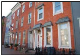
Home improvement, p. 11-14