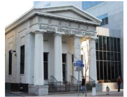
What's old is new again: Exterior of the Dauphin Deposit Bank Building/Harrisburg History Center today (above); the interior of the building during its heyday (below).