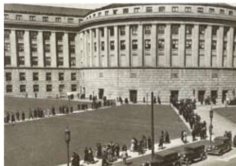
Crowds stream out of The Forum following an event in World War II-era Harrisburg (left). Except for car styles and a few trees, the view is mostly the same today (right).