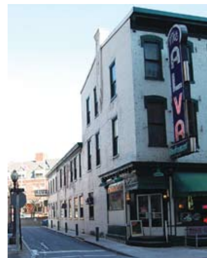
4th and Blackberry streets, Harrisburg

My heart says of you, “Seek His face!” Your face, LORD, I will seek.