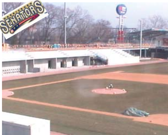
Webcam shows a nearly complete Metro Bank Park.

Will he or won't he? Among Senators fandom, that's the most pressing question as Harrisburg enters the 2010 season, which begins in Altoona on April 8, with the first home game April 15.