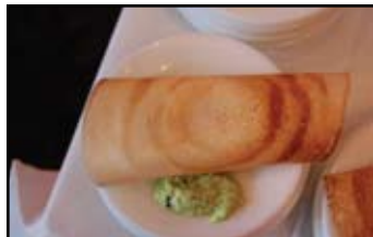
Book your passage, p. 15