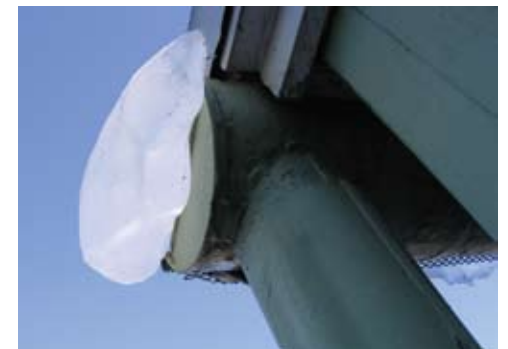
Frozen culprits: Snow piled on your roof (top) and ice packed in the gutters, like at these houses in Midtown, may have caused structural damage during the winter.

What's that old saying—make hay while the sun shines? Well, after a long, hard winter, the sun's finally shining. Time to make those home improvements before the clouds gather and the snow falls again.